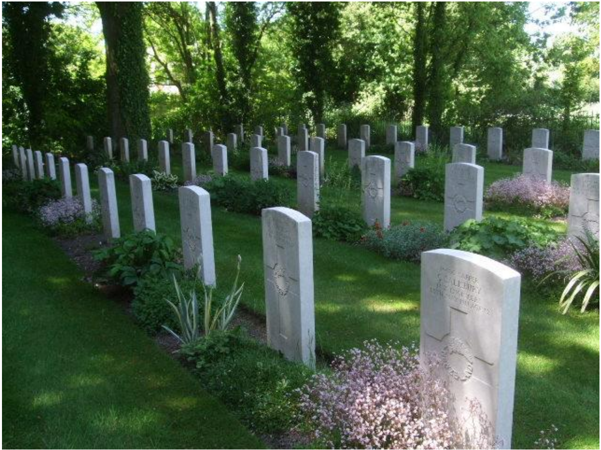
New Zealand Section of Codford Anzac War Graves Cemetery